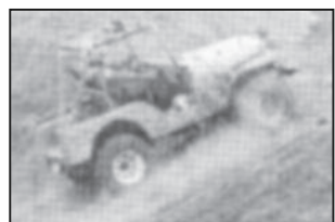
Roger Osborne kicks up some dirt.