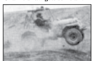
Gwen Osborne gets some air in Spidy Racer.